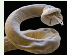
Electron micrograph of an adult lungworm

Once swallowed, the larvae migrate to the heart where they will develop into adult