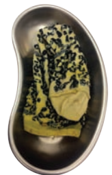
A very expensive sock that was removed from the intestines of a dog

So – as well as trying to ensure your pets don’t eat these objects, we strongly recommend pet insurance to cover you against these unexpected eventualities!