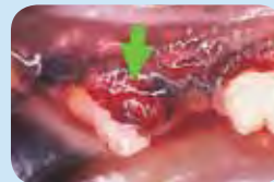
Typical lesion (arrowed). The tooth is progressively destroyed